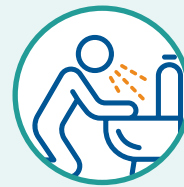
Nausea or vomiting