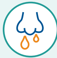
Congestion or runny nose