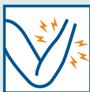
Emetak ṃajeļ ak ānbwinnōṃ