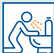
Ṁōļaāñļōñ ak eṃṃōj