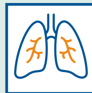
Kōjeekļok ak apañ ilo menono