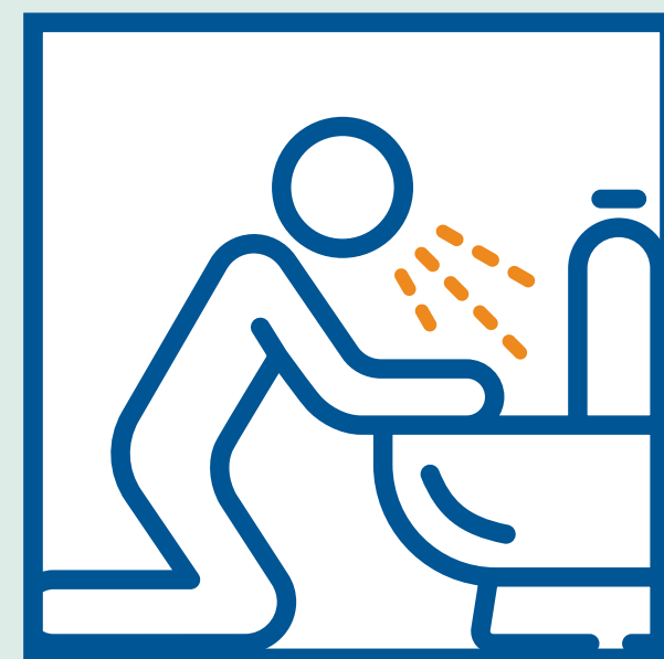
Ṁōļañļōñ ak eṃṃōj