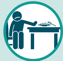
New loss of sense of taste or smell